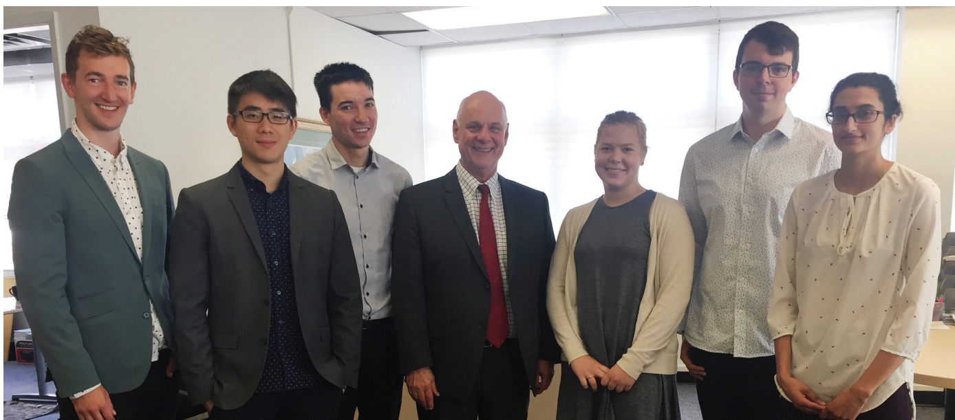
The Hon. Chief Judge Crabtree with Rise students on July 7, 2017.