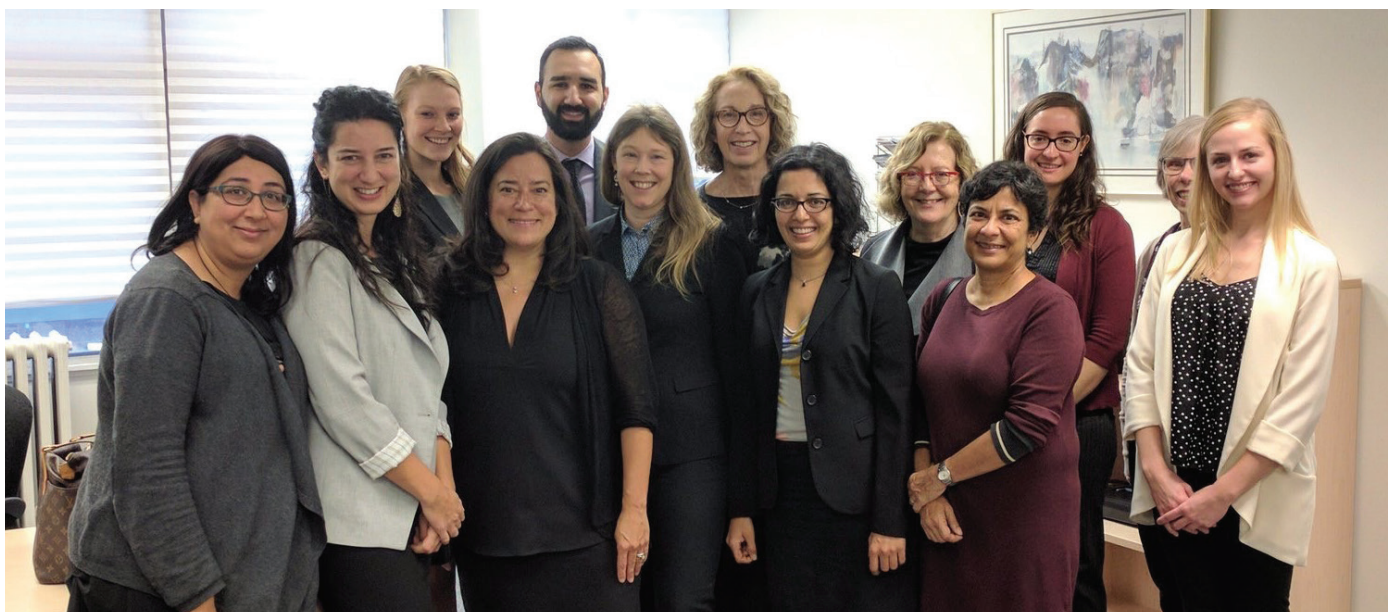
The Hon. Jody Raybould-Wilson with Board members, supporters, staff and students on November 26, 2016.