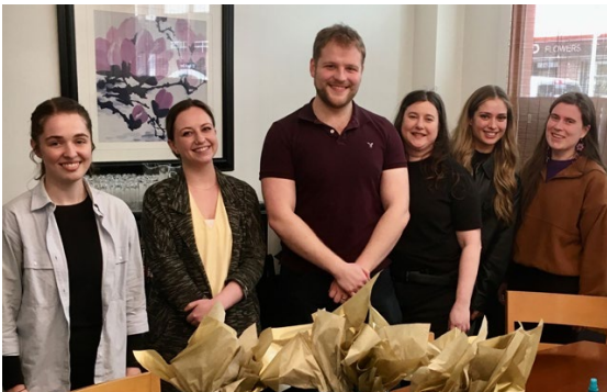
Spring 2022 students

The Student Legal Clinic plays a key role in delivering services for women in the Lower Mainland. Over 70 per cent of our students go on to practice family law, building on the valuable insight and training they received from their time at Rise. Our surveys show that over half take on pro-bono work, increasing the access to the legal system.