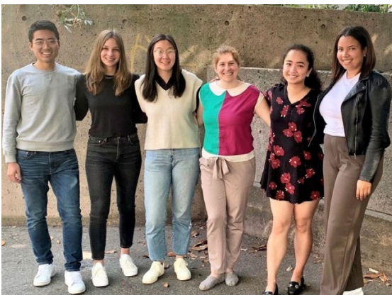
Summer 2022 students