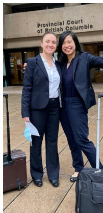
Students in court