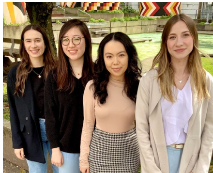
Winter 2022 students